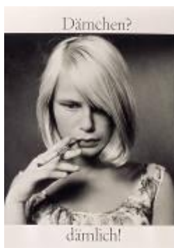
02 Anti-Smoking-Campaign: "Dämchen? dämlich!" Department: Visual Communication 1963/64 Lecturer: Adolf Zillmann Student: unknown

In the 1960s, students of the Hochschule für Gestaltung Ulm (HfG) designed a campaign against smoking.