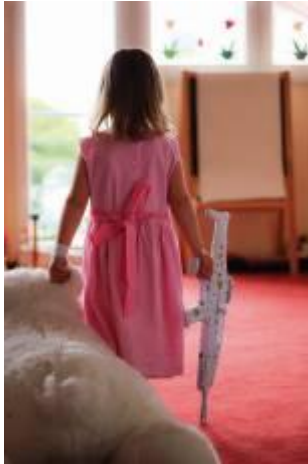
01 Gender Calling: Softair-Gun for Girls (2011)