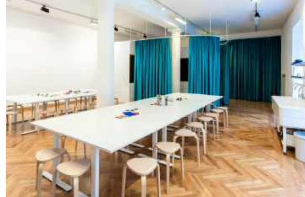
View of the Werklabor in the Museum Ulm, Photographer: Oleg Kuchar

Thu—Fri: 11 am—5 pm Sat, Sun: 11 am—6 pm