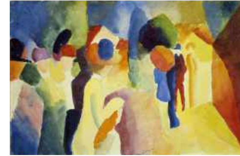
August Macke: Woman with a yellow jacket, 1913, watercolour, © Museum Ulm

How does contemporary events influence the develop- ment of a museum? What can the museum of the future look like? The exhibition “A Question of Time?” explores these and other questions. The presentation presents a reappraisal of the history of the museum, which also includes the development of the archive of the former Ulm School of Design. Objects from the various departments offer insights into the extensive collections of the museum. Visitors are invited to partici- pate in discourses on the future development of the museum.