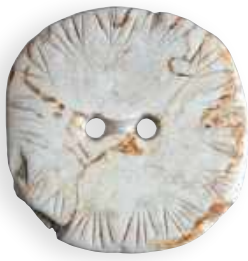
Ornamental disc, Blaustein-Ehrenstein, Neolithic, around 3,900 BC