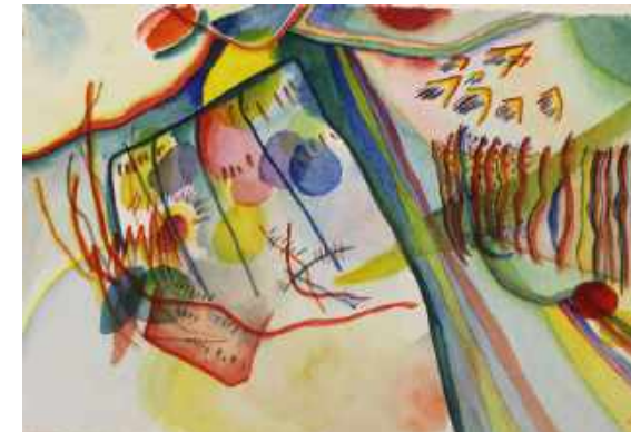
Wassily Kandinsky: Untitled, 1912, watercolour, © Museum Ulm

The graphic collection of the Museum Ulm includes around 25,000 works. It offers an overview of the most important and most formative artists of the 20th century, which extends from French graphic art of the late 19th and 20th century, a comprehensive group of works by Picasso, over representatives of German Expressionism, of “Der Blaue Reiter”, “Die Brücke” and the “Bauhaus” to the period after 1945. Since 1970, the focus has no longer been on the individual work of one artist, but rather on coherent cycles and the works of groups of artists. Due to the high sensitivity of the works, they can only be shown temporarily.